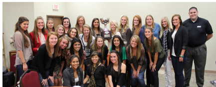
Women's Soccer #1 Great American Conference