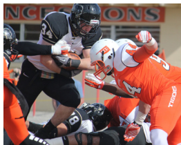
Football #3 Great American Conference