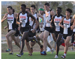
Cross Country #11 Nationally

The Learfield Sports Director's Cup recently announced that ECU currently ranks 22nd in the nation - highest of any university in the Great American Conference