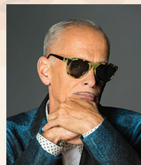
JOHN WATERS - MAY 19 KEYNOTE SPEAKER AT MOMENTUM ADA

Full Season Pass: $100 - Save $45 (INCLUDES ABOVE FEATURE PRESENTATIONS & ECU PRODUCTIONS)