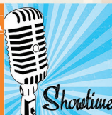
Nov. 4-5 & April 28