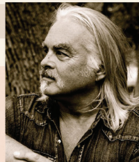
HAL KETCHUM - NOV. 10 OPENING WITH CLINT AUSTEN