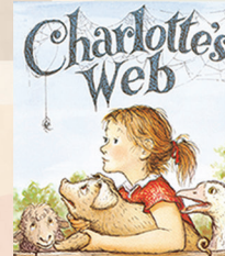
THEATREWORKS USA JAN. 20