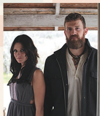
SONGS OF THE FALL - APRIL 12 OPENING WITH THE BAPTIST GENERALS