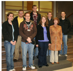
ECUTube Contest Winners Announced Watch the winning video at www.ecok.edu/ecutube