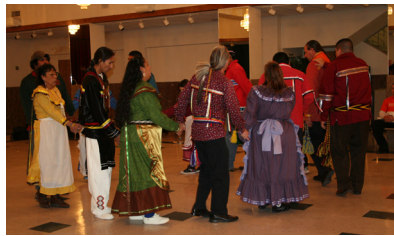
Native American Voices