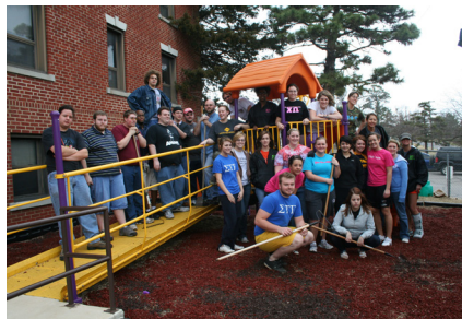
Service Saturday ECU Child Development Center