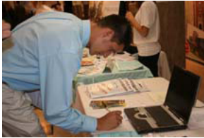
Graduate Career Fair