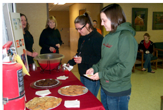
Health Information Management observe Health Information Privacy and Security Week