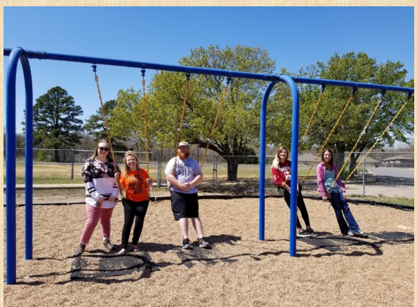
ECU Social Work Students take a break after serving lunch to students in need at Homer Elementary school during the Teacher Walkout