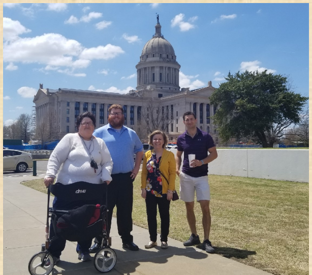
Social work students outside the Oklahoma State Capitol