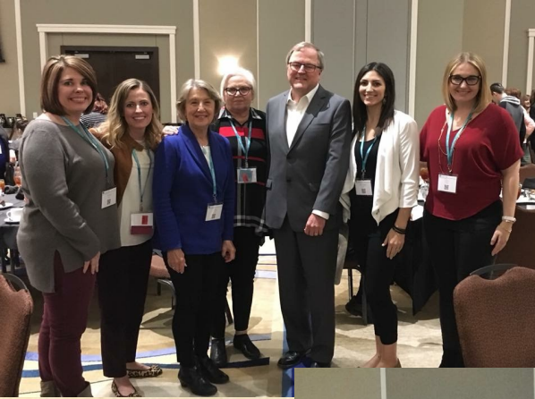
Current and previous ECU social work faculty and students attend the 2018 NASW-OK conference