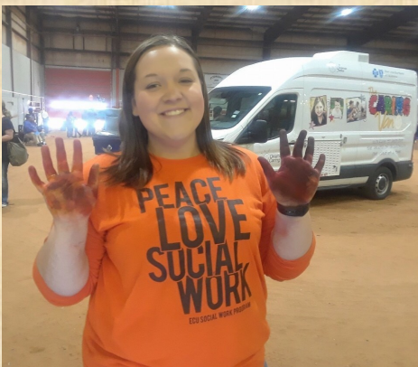
Students volunteer at the 2018 Ada Children's Fair