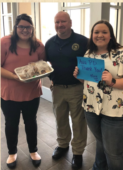
In honor of Child Abuse Awareness month (April), members of the Social Work Student Association delivered baked goods to local professionals who work to end child abuse every day of the year. Recipients included Chickasaw Nation Indian Child Welfare, Pontotoc County DHS, Pontotoc County Sheriff's Office, Court Appointed Special Advocates (CASA), and the Ada Police De-