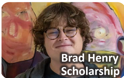
Brad Henry Scholarship

ECU's Asian Student Association hosted their annual Diwali Night with cultural dance, music, catered Nepalese food and an open dance floor inside the Stanley Wagner Ball Room.