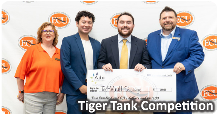
Tiger Tank Competition

Annual Tiger Tank, Tiger Promote and Tiger Trak events took place inside the Chickasaw Business and Conference Center before the annual Limes Lectureship. Students from the ECU School of Business, as well as local high schools, were given the opportunity to compete for a number of prizes. For more information and the names of the winners, visit ecok.edu/news .