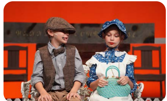
ECU Showtime presents Tom 'N Huck