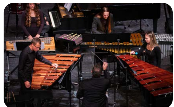
ECU Band and Music events fill up November calendar

For more photos, visit www.ecok.edu/photo-galleries