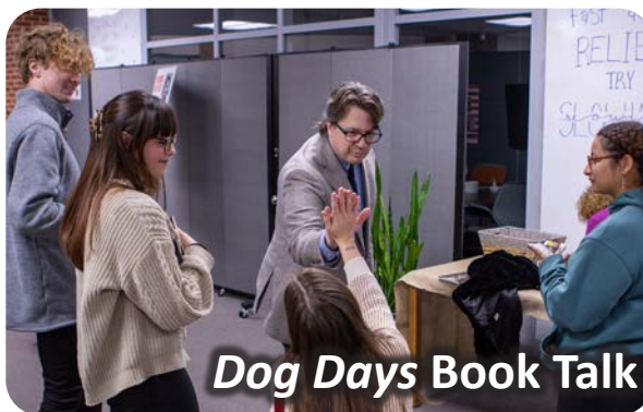
Dog Days Book Talk

For more information, visit ecok.edu/news .