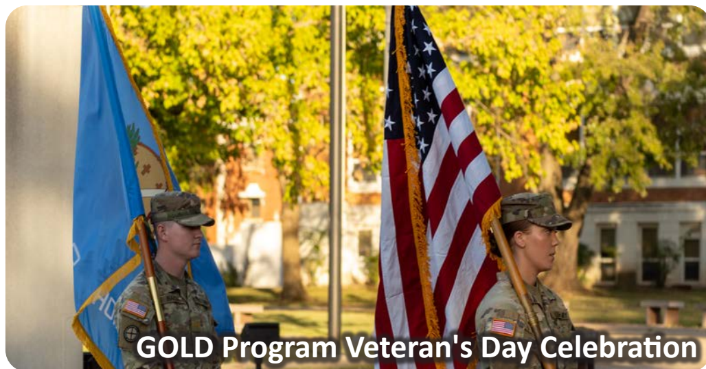
GOLD Program Veteran's Day Celebration