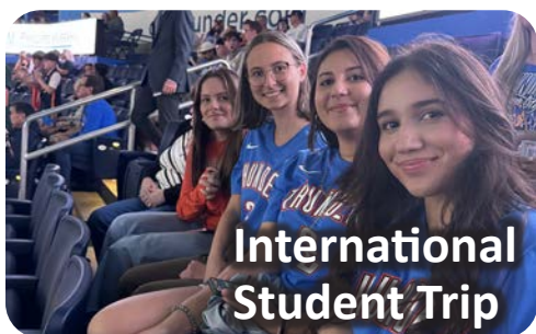
International Student Trip

International students from ECU's sister-school in France currently enrolled at ECU presented information about their home university to a crowd of current students interested in experiencing Study Abroad.