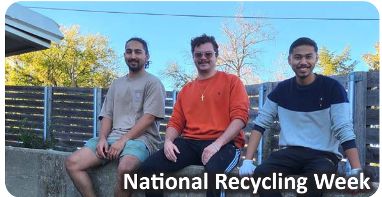
National Recycling Week

Annual Tiger Tank, Tiger Promote and Tiger Trak events took place inside the Chickasaw Business and Conference Center before the annual Limes Lectureship. Students from the ECU School of Business, as well as local high schools, were given the opportunity to compete for a number of prizes. For more information and the names of the winners, visit ecok.edu/news .