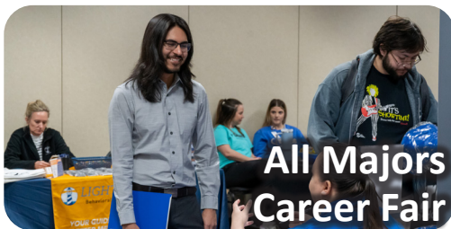
All Majors Career Fair