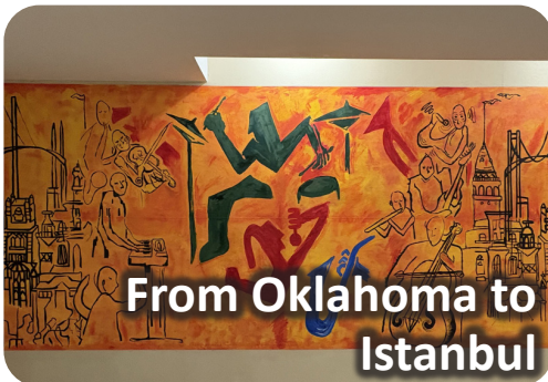
From Oklahoma to Istanbul