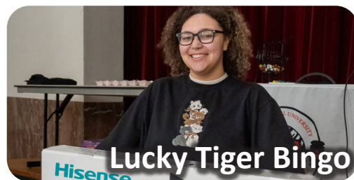
Lucky Tiger Bingo