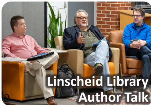
Linscheid Library Author Talk