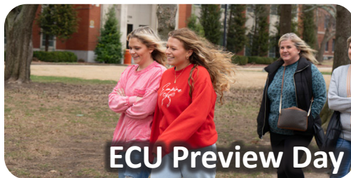
ECU Preview Day

The spectacular fusion of music, dance, theatre and live painting known as Artrageous came to the Ataloo Theatre. Community members came together to participate in activities, enjoy the show and give the nationally recognized cast of Artrageous an exciting ECU and Ada welcome.