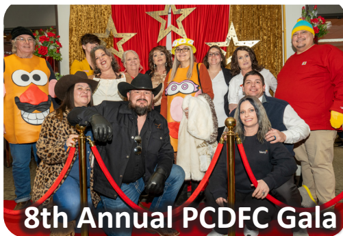
8th Annual PCDFC Gala