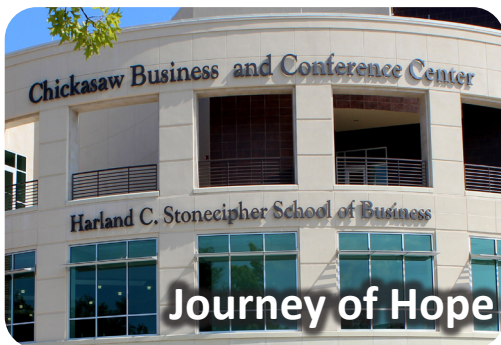
Journey of Hope

The Pontotoc County Drug Free Coalition held their annual Gala on the ECU campus with members of the community and ECU administration in attendance. PCDFC is a local group of volunteer community members collaborating in an effort to prevent substance abuse and promote recovery.