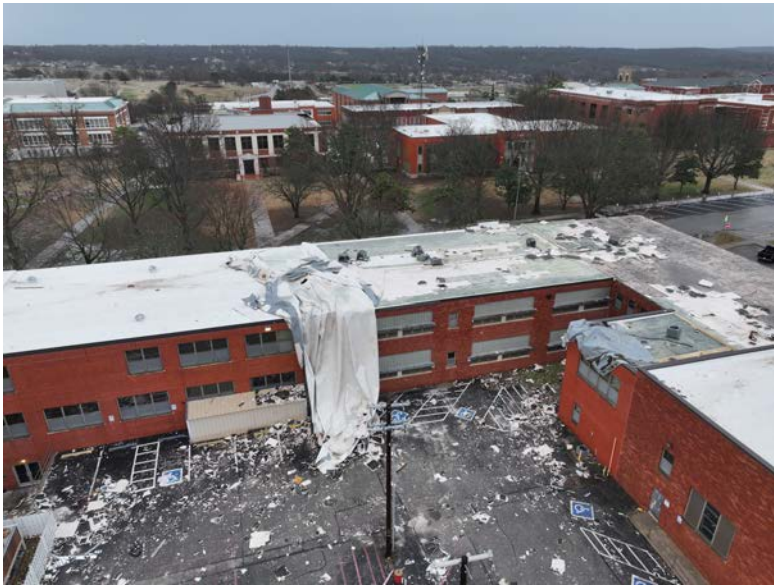
Extensive Roof Damage to Faust Hall

East Central University experienced significant damage after a severe storm hit campus early Tuesday morning, March 4.