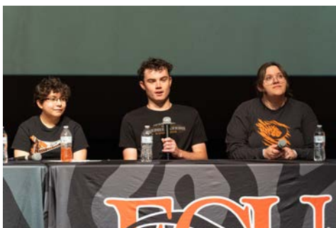
Junior Day Student Panel