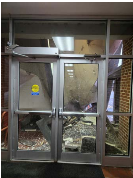
South Entrance Faust Hall

Faust Hall suffered the most extensive damage and will remain closed for the rest of the academic year. ECU administrators coordinated closely with local emergency responders, city officials, and support organizations on recovery efforts. The ECU community has shown incredible support. Together, we remain committed to rebuilding our campus stronger than before.