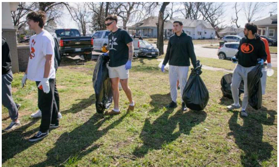
The ECU Football Team stepped up to help our community by cleaning up trash and debris in local neighborhoods and schools.