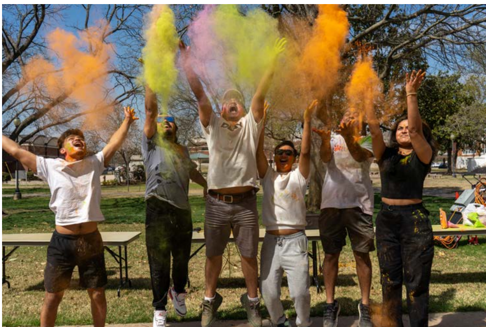
Asian Student Association Celebrating Holi Festival