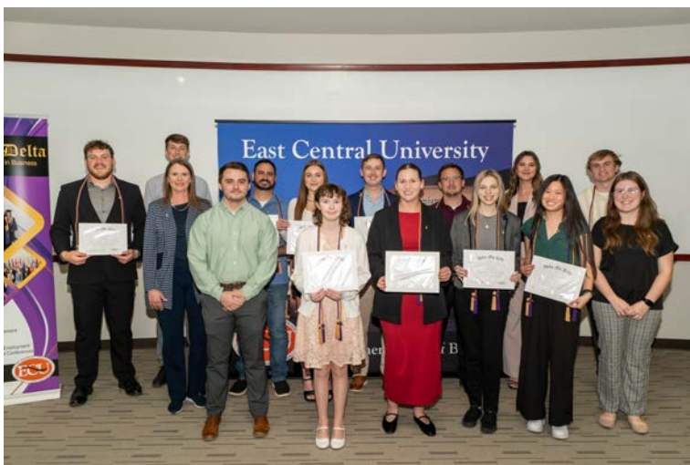
Delta Mu Delta Induction Ceremony